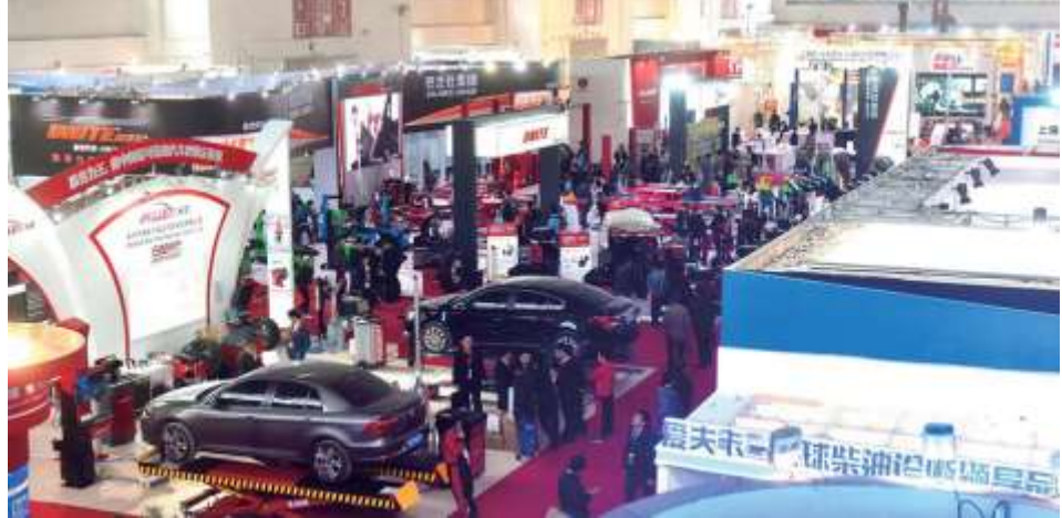
AMR 2018 will be held from 1 – 4 April 2018 at the New China International Exhibition Centre (NCIEC) in Beijing

The newly formed joint venture company Messe Frankfurt Traders-Link (Beijing) Co Ltd is set to present the revamped Automotive Maintenance and Repair Expo (AMR) with an improved product range to better serve China's dynamic automotive aftermarket. As one of Asia's largest repair and maintenance industry events, AMR 2018 will attract 1,200 exhibitors and approximately 60,000 trade visits are expected to explore the unwavering business opportunities and developments in 110,000 sqm of trade space. The show is co-organised by the China Automotive Maintenance Equipment Industry Association (CAMEIA) and the China Automotive Maintenance and Repair Association (CAMRA), and will be held from 1 – 4 April 2018 at the New China International Exhibition Centre (NCIEC) in Beijing.