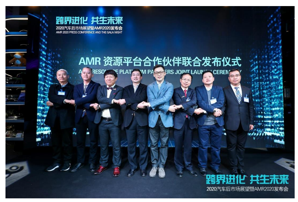
Organisers and supporting partners at the AMR resources platform partners jointed launch ceremony

Summit, LubTop 2019 Awards, National Parts Dealer Conference, China Auto Beauty Championships, the 5th Auto Diagnostics Master Finals, Green Repair and Maintenance Industry Forum, China Aftermarket "Northwest Day" Special Event, AMR 2020 China Aftermarket Crossover Banquet, the Integration of Production and Education Forum and more. Elsewhere, there will also be business matchmaking programmes to pinpoint the specific needs of both exhibitors and buyers, heightening exhibiting efficiency, experience and results. AMR, therefore, continues to bring forward transformation in the ever-evolving automotive aftermarket.