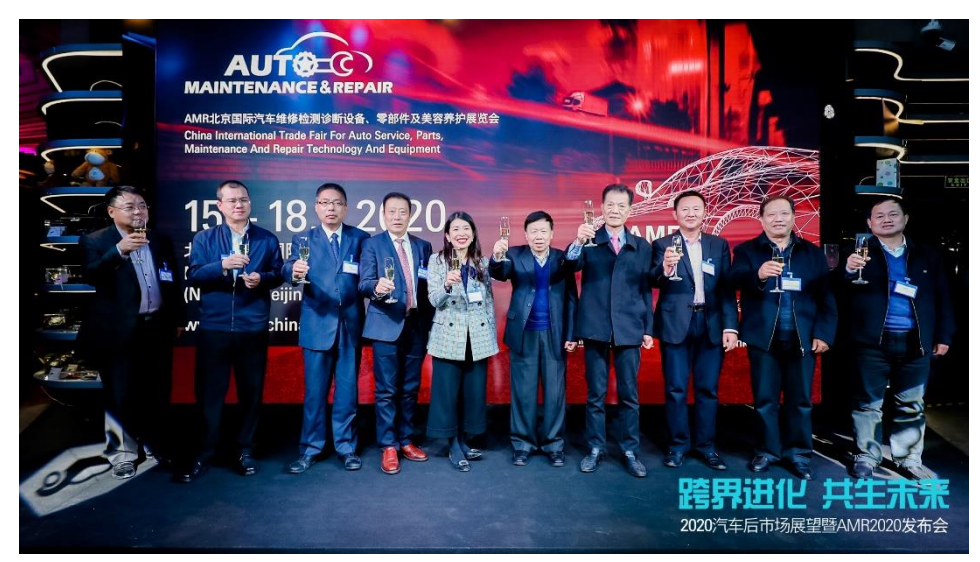
Industrial organisations pledge their support to AMR2020